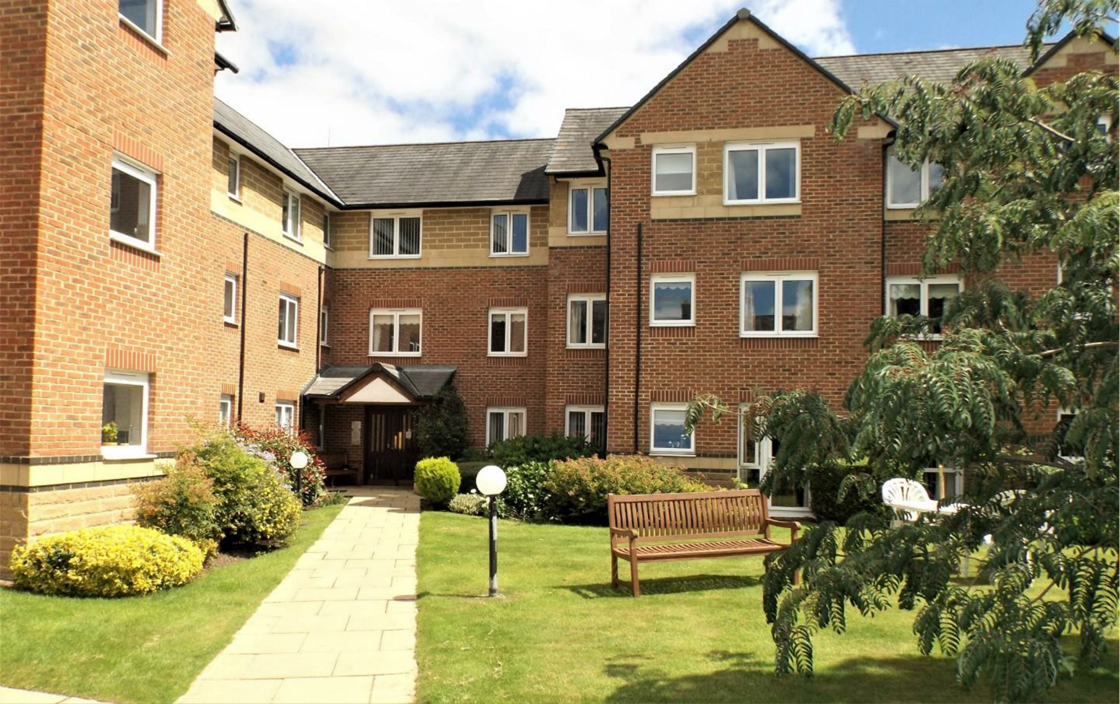
📍 Silvas Court, Morpeth NE61 1HQ